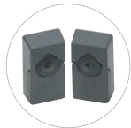
771E Infrared Safety Sensor