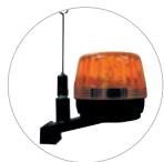
FLA230-2 Flashing light kit

For more accessories please refer to accessory catalog